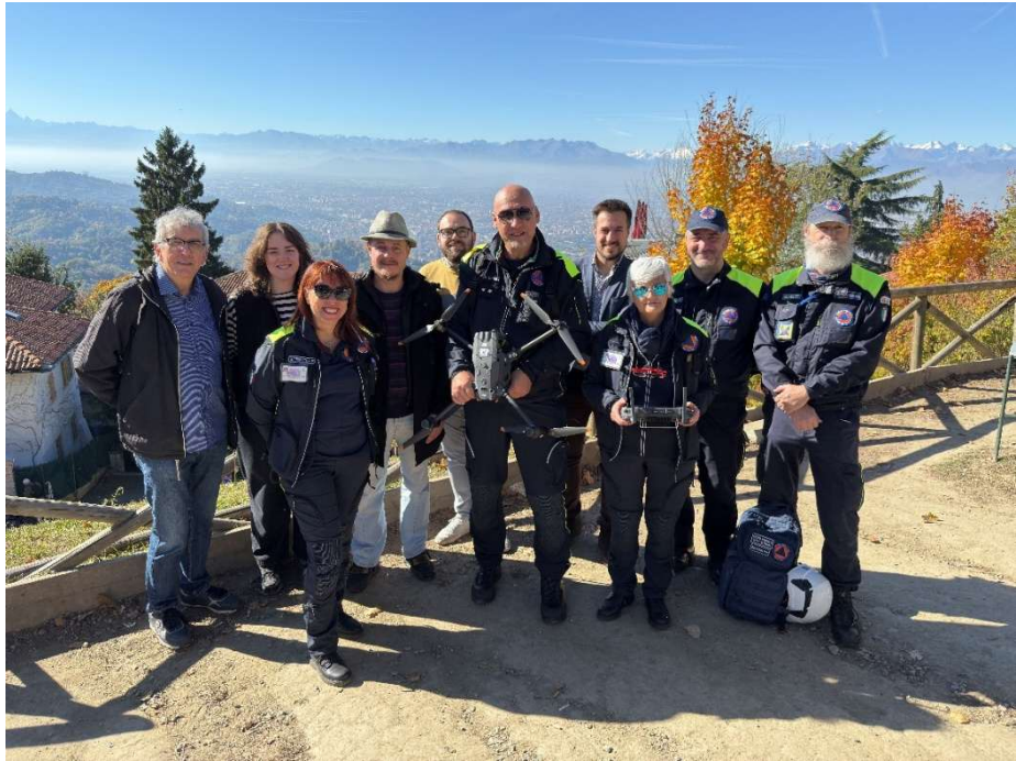
Project team during the DEMO