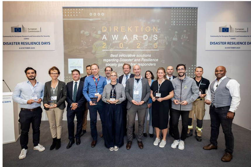
DIREKTION project team